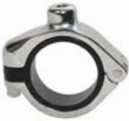
Housing with Black inserts are "Anchor" supports

Features: The threaded mounting section, on top of clamp shell, doubles as a threaded rod connector and a welding platform. This type rod connection does not offer the dynamic slope adjustment feature. Figure 121 RHT, with a rod, can also be used in combination with the figure 125 or 126 stanchions. This combination will allow the support to be adjusted telescopically to the tube or pipe elevation. Call customer service for the price and availability of special rod lengths.