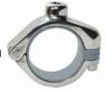
Housing with Gray inserts are "Guide" supports

Shearing: Anchors - Refer to shear force diagram in technical section Guides - Allow for thermal expansion of tube or pipe